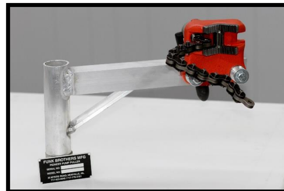
SWING IN VISE ASSEMBLY