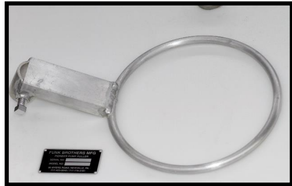
HALO OVERHEAD PIPE GUIDE