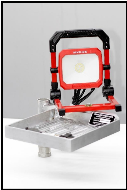
LIGHT KIT / TOOL TRAY (available without light)