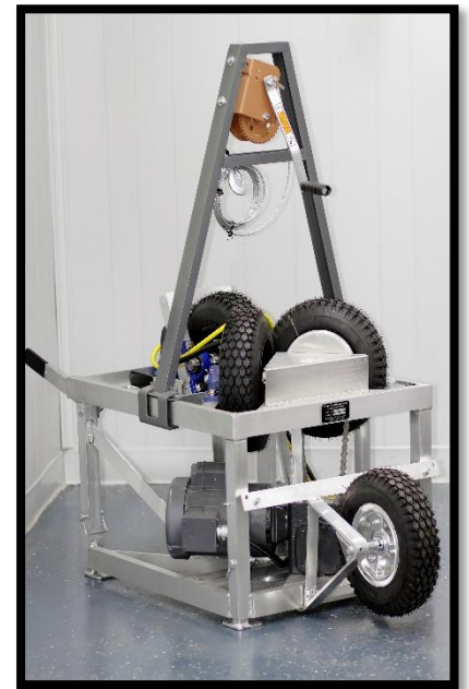
MODEL 200 A-FRAME WINCH ATTACHMENT

Funk Brothers also has the ability to repair and/or rebuild similar designs of pump pullers. We carry a full inventory of parts and accessories. Call Kirby Spahr today for all your pump puller needs!