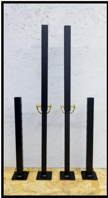
SUPER HIGH LEG KIT (telescoping)